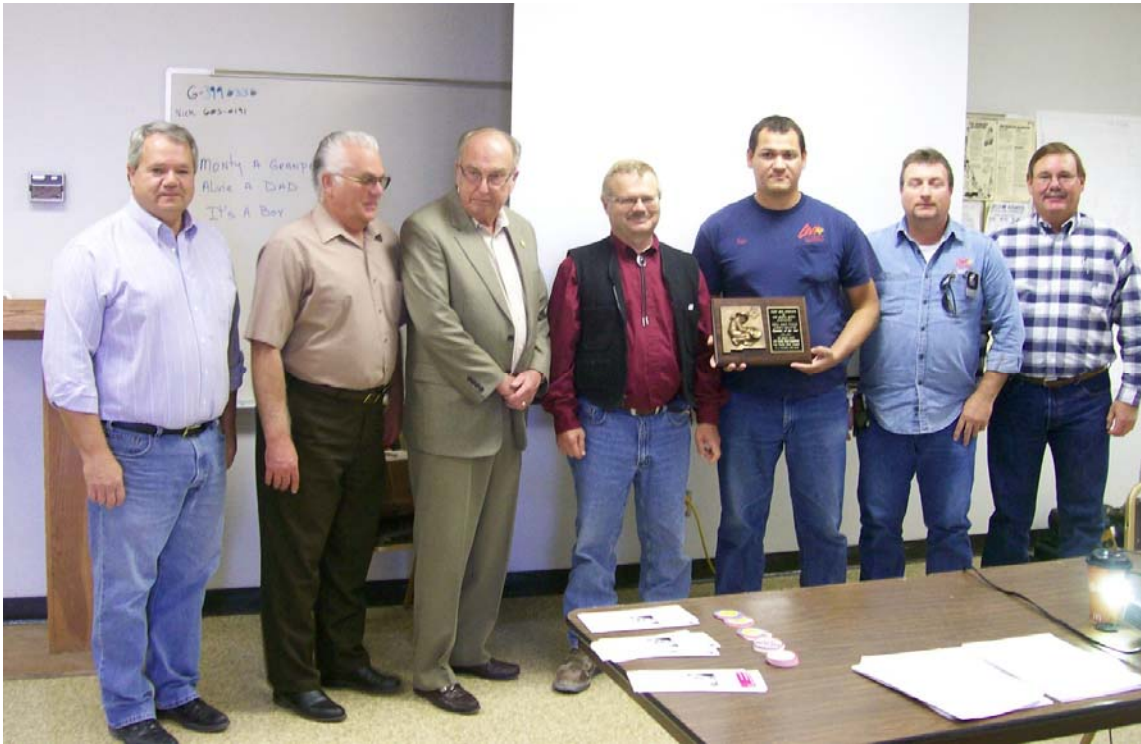
Members of Lea County Road Department receive Safe Operator of the Year Award from SMI, Senator Leavell, and Lea County Commissioners

The awards were particularly gratifying because of the excellent safety record that New Mexico operations have registered during 2010. We have changed a generation of thinking that said zero accidents was not an obtainable goal, to one that says it is the only acceptable goal.