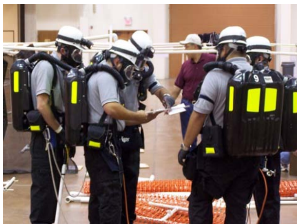
Miners compete in a mine rescue competition supported by BMS

exercise was very successful and a great deal was learned. The BHPBilliton exercise included an active shooter scenario that led to a truck accident and accidental discharge of explosives. The goal of the SMI is to continue working with mine operators conducting these types of exercises in other parts of the state.