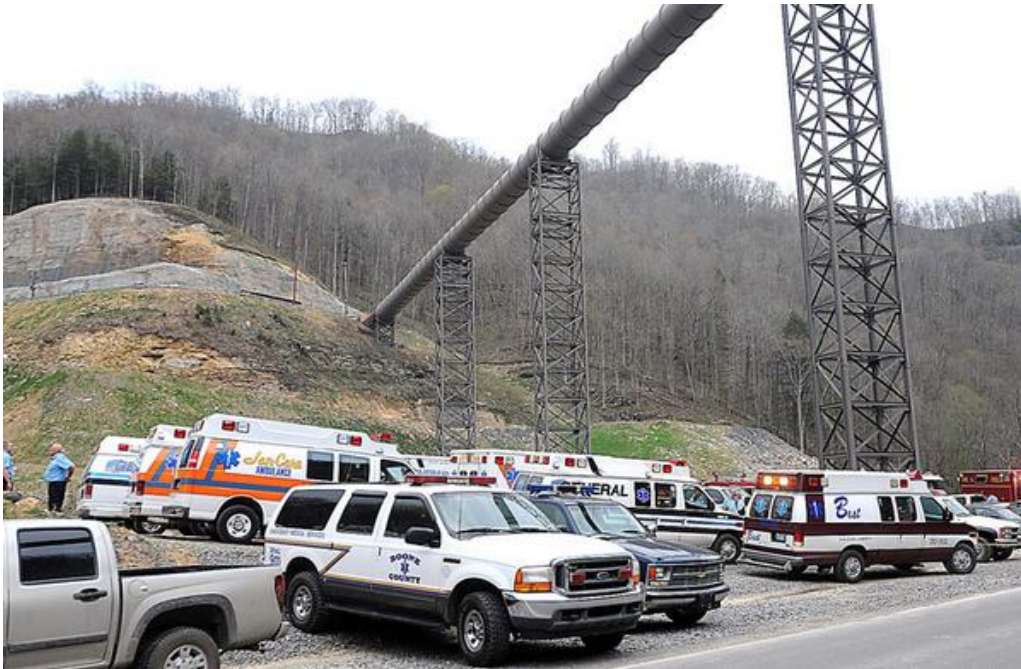
Ambulances await mine rescue crews searching for survivors at Upper Big Branch Mine in West Virginia

This event was the source for various Con-