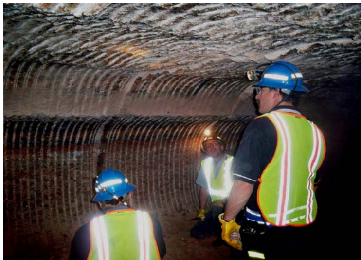
MSB members examine roof and rib at Intrepid's potash mine

The BMS worked on its major grant application during 2010. This application was for renewing the FY 2010 grant agreement between the Mine Safety and Health Administration (MSHA) and New Mexico Institute of Mining and Technology. The grant has been utilized by BMS to train New Mexico miners to meet the training requirements of MSHA as required in 30CFR parts 46 and 48. The grant application was completed in August and approval of the $147,305 grant was received in