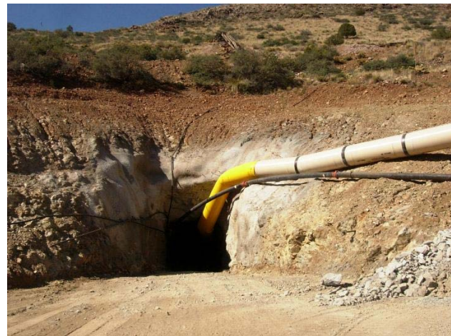
Entry to mine where fire resulted in violation and penalty.

One violation for failure of emergency notification was issued by the SMI during 2010. The incident for which the violation was issued involved a fire at an underground gold mine. The operator failed to notify the SMI of the fire as required by regulation.