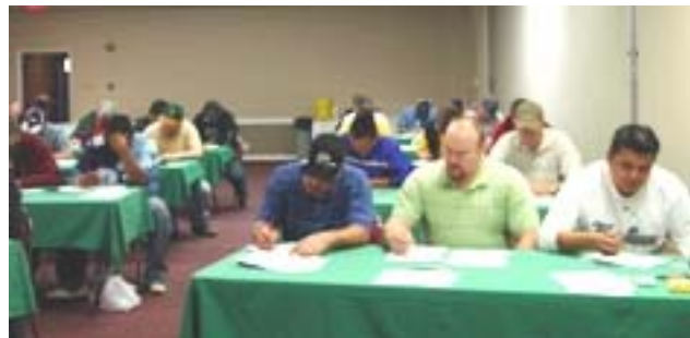
BMS New Miner Training

The Bureau of Mine Safety exists to actively promote the safety of the miners of New Mexico. BMS trained over 2400 miners during 2010. This includes over 200 miners trained in Spanish language classes.