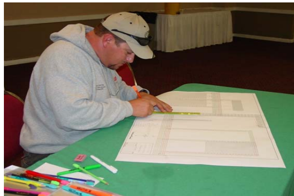
Candidate for Coal Mine Foreman Certification works on a ventilation map during testing

During 2010, a review of re-certification requirements and testing criteria for coal mining officials was conducted. This has been a collaborative process with the coal mining industry in New Mexico. The data base of questions continues to be reviewed by the BMS to keep testing relevant.